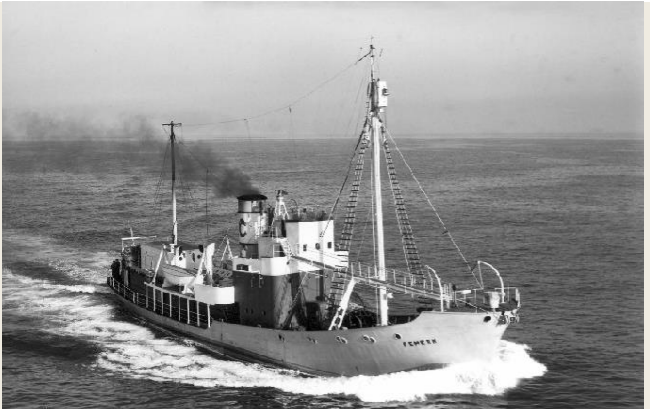
SFJ00219510420001 DS/Hvb FEMERN.